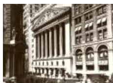
J. P. Morgan & Co. Offices

These techniques convinced the Rothschilds that they had found their man. They sent their personal representative, Jacob Schiff, to Cleveland to help Rockefeller (Rothafel) plan further expansion. At this time, the Rothschilds controlled 95% of all railroad mileage in the United States, through the J.P. Morgan Company and Kuhn Loeb Company, according to official Department of Commerce figures for the year 1895. J.P. Morgan mentions in his "Who's Who" listing that he controlled 50,000 miles of U.S. railways. Schiff worked out an elaborate rebate deal for Rockefeller, through a dummy corporation, South Improvement Company. These rebates ensured that no other oil company could survive in competition with the Rockefeller (Rothafel) firm. The scheme