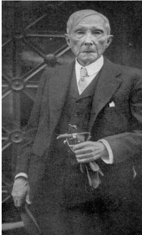
John Davidson Rockefeller