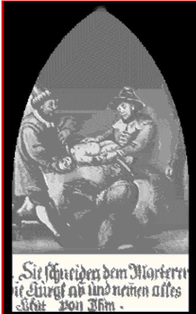
Andreas of Rim: "They cut ... and took all his blood from him"