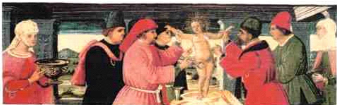
Simon of Trent by Gandalfino d'Asti

The Jewish ritual-murder is as old as Jewry itself; to a further definition the objection could be made, insofar as the Gentile view is concerned, of subjectivity, injustice, or even partisan malice. For this reason we present for clarification of the concept a Jewish passage, still generally valid today, from the Zohar , a "holy book" of Judaism, which is placed even before the Talmud by Jewish Orthodoxy. While the Talmud says in one passage ( Baba mezia 114b) -- to use this as an introduction -- that only Jews are designated as human beings while the remaining peoples of the world (thus, all non-Jews, not only the Christian peoples) are called cattle, the Cabbalistic Zohar ( Shining Light ) contains an unmistakable directive for ritual-murder. This reads, verbatim according to the authentic translation of Dr. Bischoff: "Further, there is a command of slaughtering, which takes place in a ritually valid manner for strangers, who are not human beings but are like unto cattle. For those who do not concern themselves with the Jewish religious law, must be made offerings (!) of prayer, so that they are offered as sacrifice to the blessed God. And when they thus are offered to Him, it is said of them: "for thy sake are we murdered the whole day, slaughtered, like sheep at the slaughtering bench" (compare to this Psalm 44:23)!