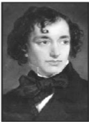
Benjamin Disraeli 1804-1881

Revealed that members of the same tribe had hijacked the motion picture, sport and entertainment business and controlled the American Media and were leading America to ruin: wrote "You don't need the League of Nations to end wars. Gather together the fifty most wealthy Jewish Financiers who create wars for their own profit - control them and you will put an end to it all". The International Jew .